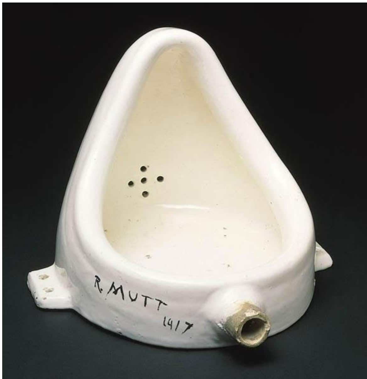
Figure 2: Fountain , Urinal signed by Marcel Duchamp, 1917