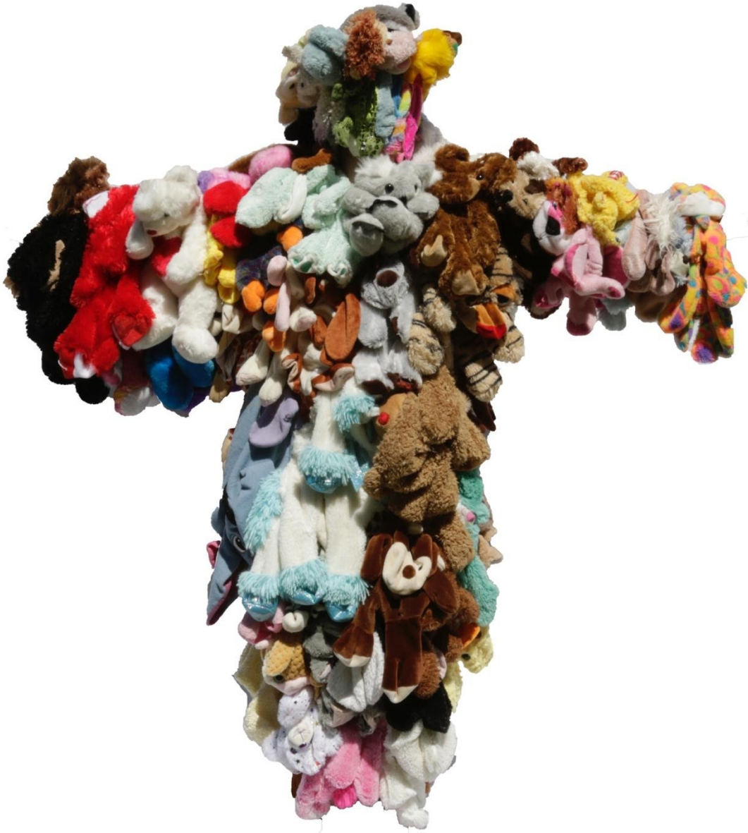
Figure 5: Adolescence is All Fun and No Play; Adulthood is All Play and No Fun (Front) , 5'x5'x1.5', Stuffed Animals, 2020