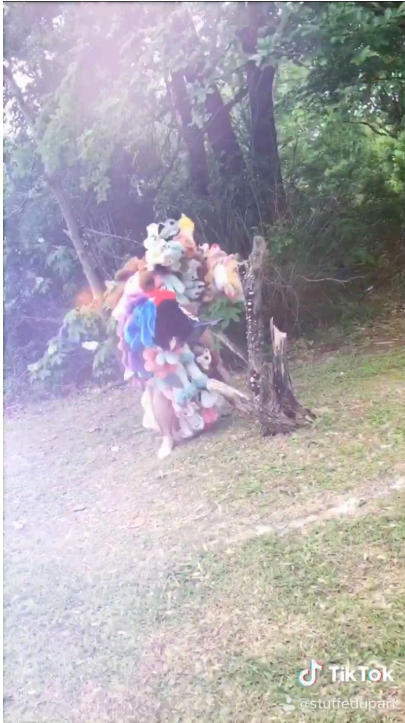
Link 6: Groove is Fun; Reliance is Dependence; Independence is Key , Video Performance, 2020

https://www.tiktok.com/@stuffedupart/video/6821687464307002629?u_code=dc37g5gd84525d&preview_pb=0&language=en&d=dc37g7g2g6jl57&timestamp=1588378292&utm_campaign=client_share&app=musically&utm_medium=ios&user_id=6818625879662412806&tt_from=sms&utm_source=sms&source=h5_m