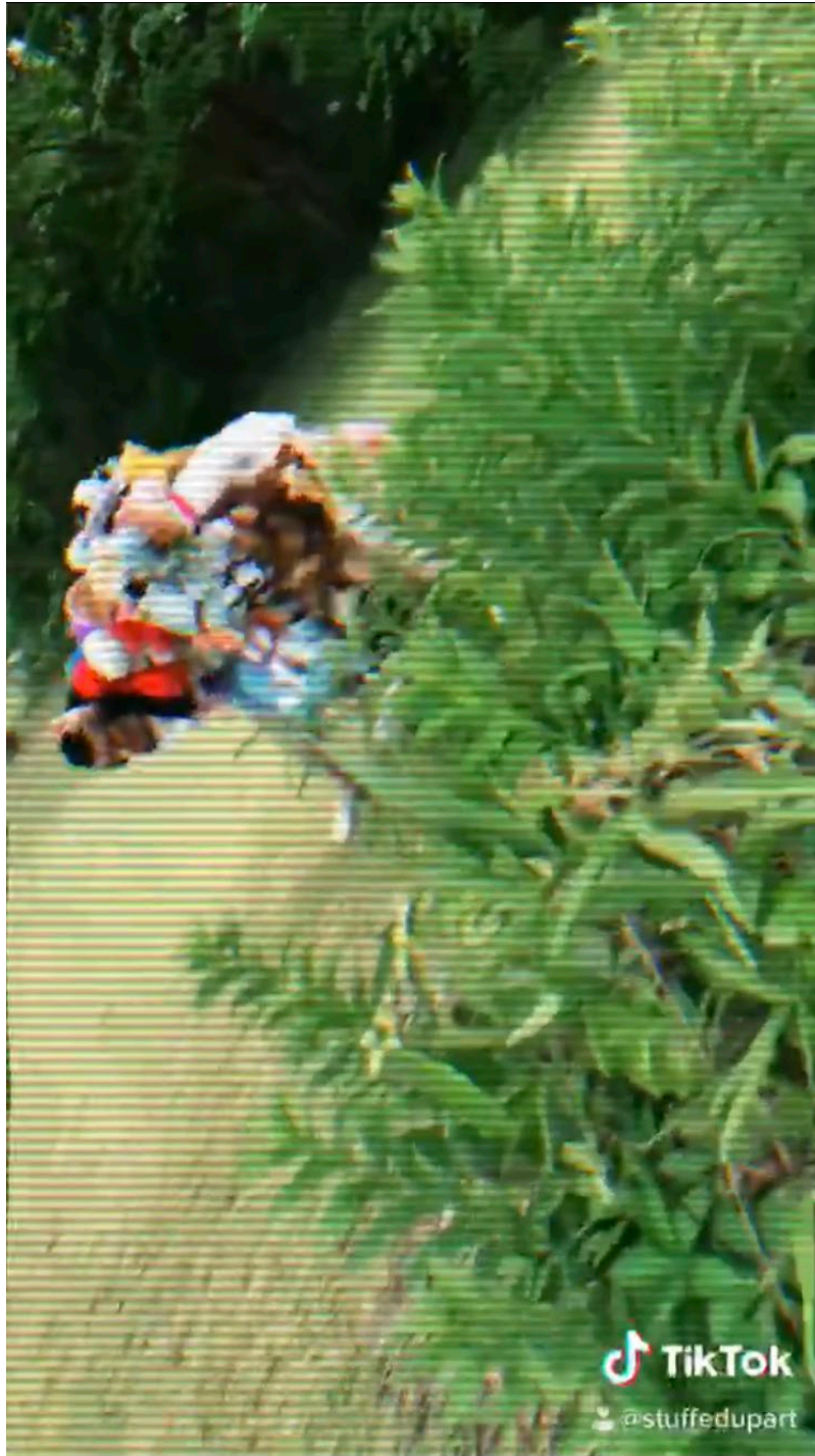
Link 3: Wealth is Not the Only Positive the World Can Benefit From , Video Performance, 2020

https://www.tiktok.com/@stuffedupart/video/6821686927629077765?u_code=dc37g5gd84525d&preview_pb=0&language=en&d=dc37g7g2g6jl57&timestamp=1588378275&utm_campaign=client_share&app=musically&utm_medium=ios&user_id=6818625879662412806&tt_from=sms&utm_source=sms&source=h5_m