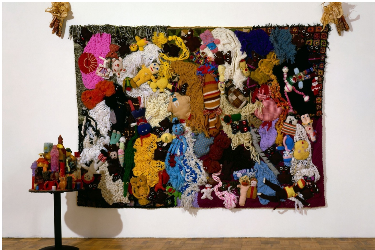
Figure 4: Multiple Stuffed Animal Works by Mike Kelley, 1987