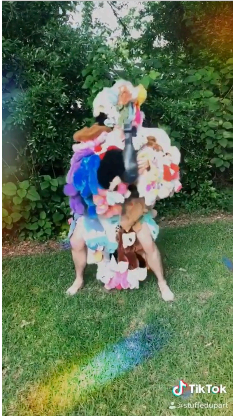
Link 2: Rid Yourself of Unnecessary Anxieties , Video Performance, 2020

https://www.tiktok.com/@stuffedupart/video/6821686459603406085?u_code=dc37g5gd84525d&preview_pb=0&language=en&d=dc37g7g2g6jl57&timestamp=1588378226&utm_campaign=client_share&app=musically&utm_medium=ios&user_id=6818625879662412806&tt_from=sms&utm_source=sms&source=h5_m