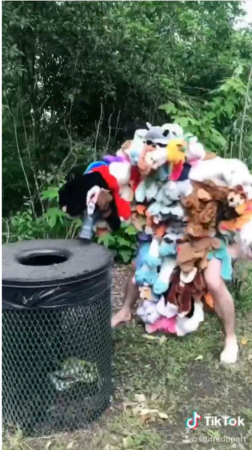
Link 5: Distractions Synchronize; Ignorance is Bliss , Video Performance, 2020

https://www.tiktok.com/@stuffedupart/video/6821686751984094469?u_code=dc37g5gd84525d&preview_pb=0&language=en&d=dc37g7g2g6jl57&timestamp=1588378259&utm_campaign=client share&app=musically&utm_medium=ios&user_id=6818625879662412806&tt_from=sms&utm_source=sms&source=h5_m