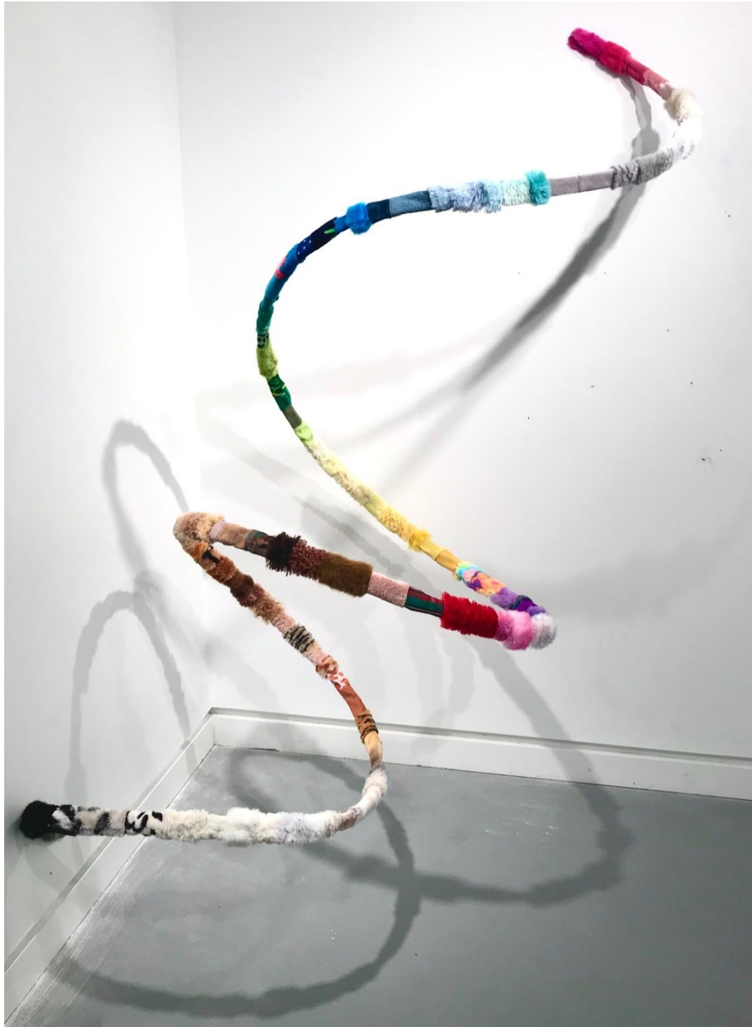
Figure 7: Do Not Mistake the Unexpected For Lies , 6' From End to End; 3.5' At Widest Point, Stuffed Animal Pieces and Steel, 2020