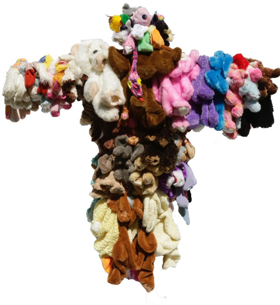
Figure 6: Adolescence is All Fun and No Play; Adulthood is All Play and No Fun (Back) , 5'x5'x1.5', Stuffed Animals, 2020