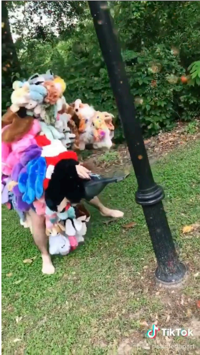
Link 4: Reality Only Has One Side To Things , Video Performance, 2020

https://www.tiktok.com/@stuffedupart/video/6821687031891070213?u_code=dc37g5gd84525d&preview_pb=0&language=en&d=dc37g7g2g6jl57&timestamp=1588378283&utm_campaign=client_share&app=musically&utm_medium=ios&user_id=6818625879662412806&tt_from=sms&utm_source=sms&source=h5_m