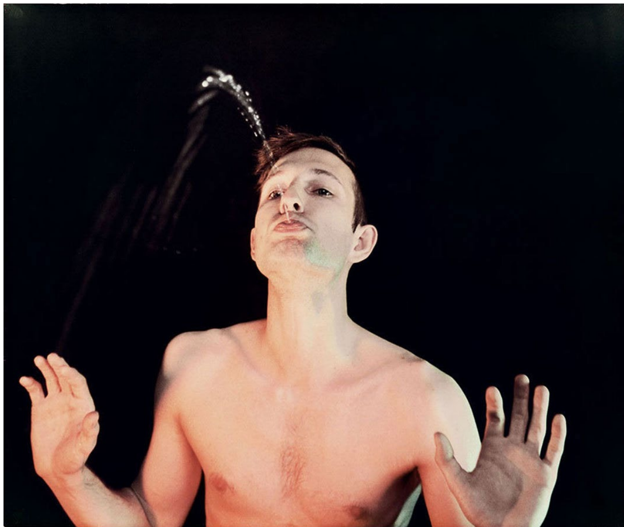
Figure 3: Self-Portrait as a Fountain , Performance by Bruce Nauman, 1966