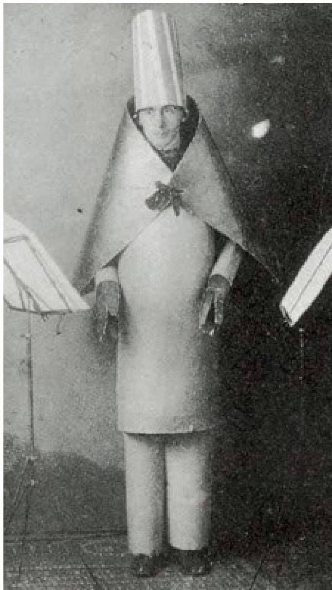
Figure 1: Karawane , Recitation and Performance by Hugo Ball, 1916